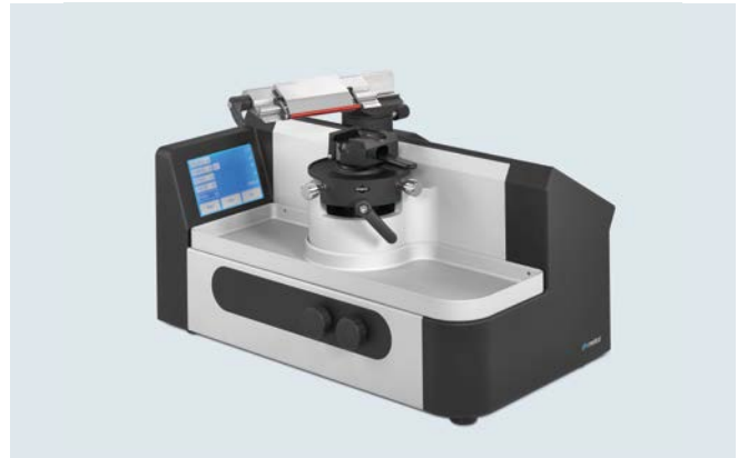
pfm Slide 4005 E (electronically)*

* (pfm Slide 4004 M and pfm Slide 4005 E with pfm Blade Holder)