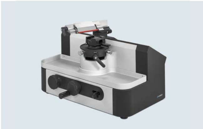
pfm Slide 4004 M (manually)*

* (pfm Slide 4004 M and pfm Slide 4005 E with pfm Blade Holder)