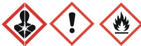
Aspiration hazard Skin irritation Flammable liquids